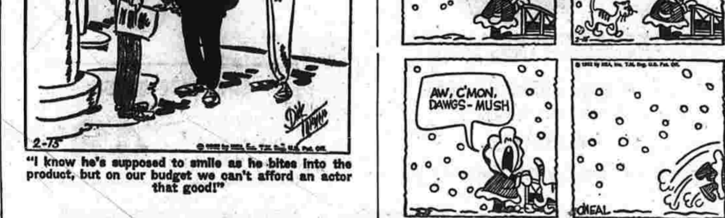
BY FRANK O'NEAL