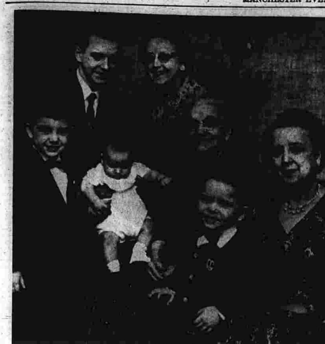
Five Generation Family

CAPE TOWN—The population of Kruger National Park in South Africa includes 1,000 lions, 1,000 elephants, 350 leopards, 100,000 impalas, 7,000 buffaloes, and 2,000 giraffes.